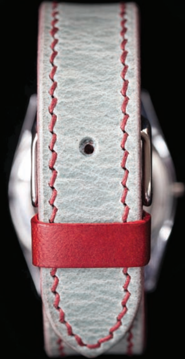
single hole strap in Atlantic shoulder leather lined in cherry red leather with brick thread

It allows you to personalise a watch and tweak its presentation in order to make it align with your personal aesthetic and style.”