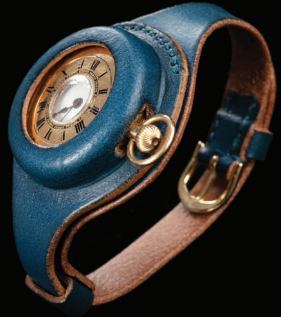
plain/military style fob watch wrist strap in indigo bridle leather with blue stitching for an antique half-hunter gold fob >

We can adapt the design to suit the location of the bow. Access to the fob for maintenance is from the back via a flap – the wrist keeping the flap secure whilst the strap is being worn.