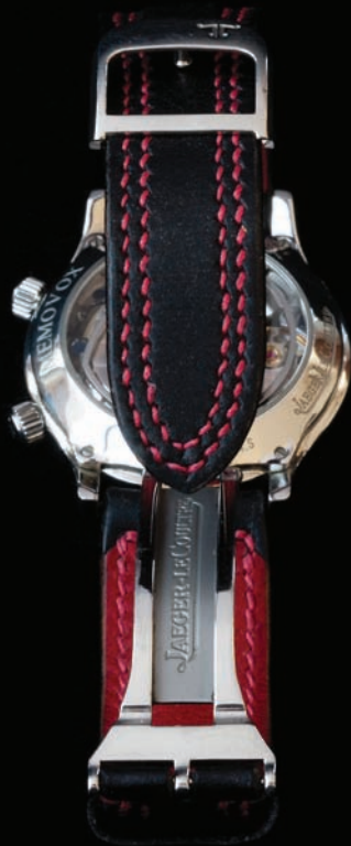
black bridle leather with red bridle lining and red twin stitching with a Jaeger-LeCoultre deployment clasp