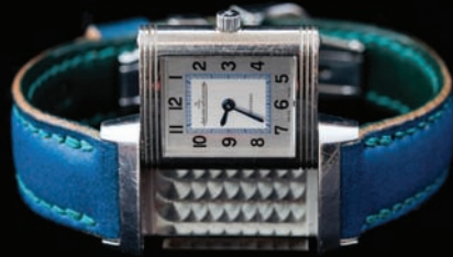
< (top centre) JLC Reverso in indigo bridle leather, green lining with peacock stitching