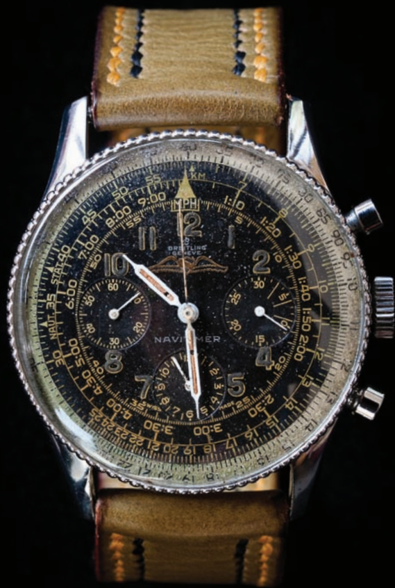
Breitling Navitimer in vintage khaki bridle leather, twin stitched in gold and black.