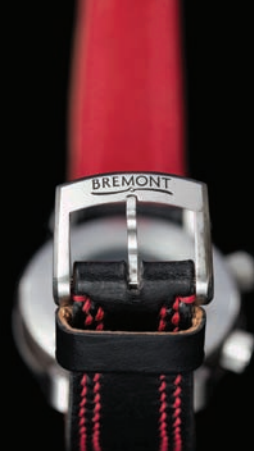
reuse existing buckle twin stitch